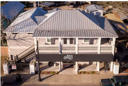
GLORY BOUND GYRO CO