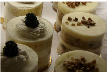
FRENCH KISS PASTRIES