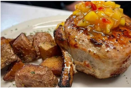
MASION DE LU