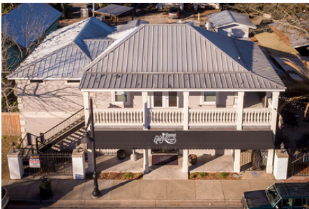
GLORY BOUND GYRO CO