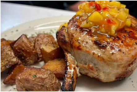
MASION DE LU